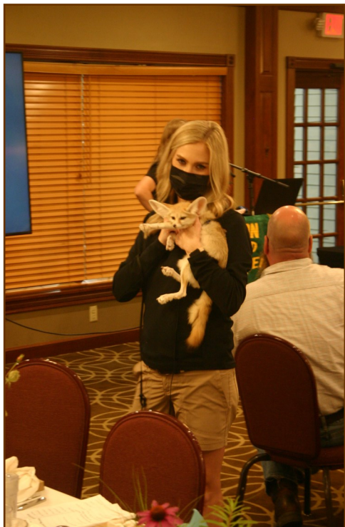
Pictured above is Fletcher

Attendees enjoyed an up-close look at several of the Columbus Zoo and Aquarium's animal ambassadors. The animal ambassadors that visited were Trout (African penguin), Charlotte (binturong), Fletcher (fennec fox), Gary (Eastern screech owl), Chanel (striped skunk), Edna (short-beaked echidna), and Sonny (two-toed sloth).